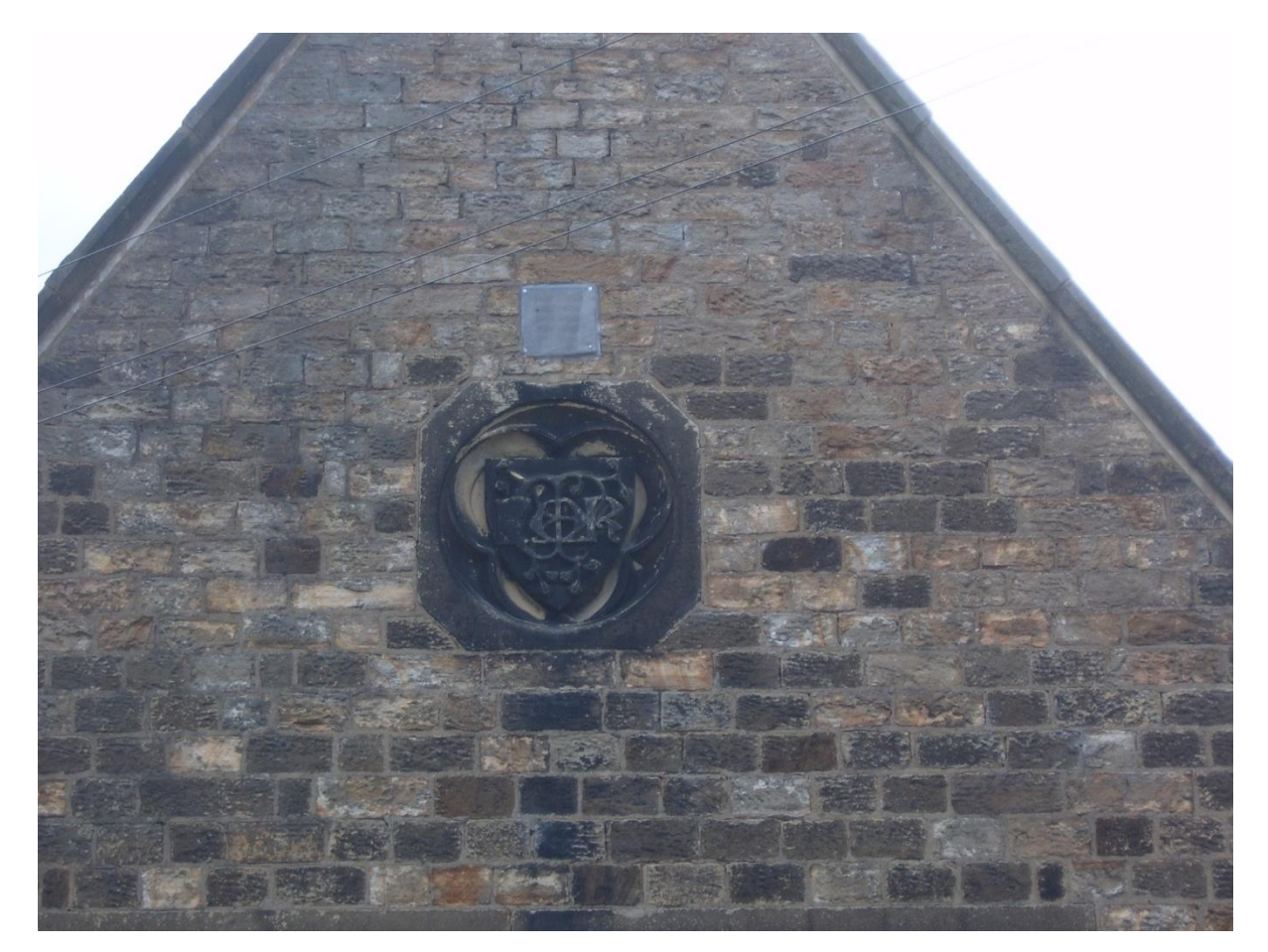
"Signature" stone on the gable end of Kildwick School

The same "signature" stone is to be found on Kildwick School.